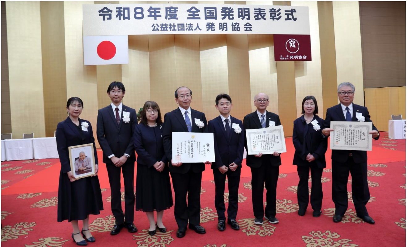
【Commemorative photograph of the award recipients with their families and colleagues】