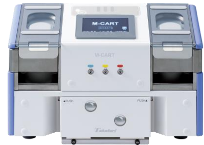
【Exhibition of M-CART® as an implementation example of the awarded invention at the reception venue】